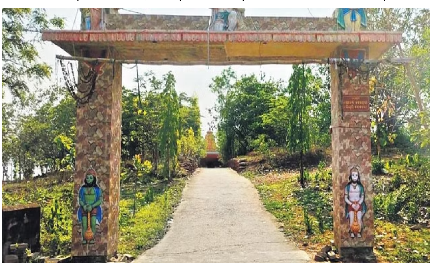
By Arabinda Panda